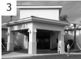
HOBE SOUND PUBLIC LIBRARY

2551 SW MATHESON AVE PALM CITY, FL 34990 PHONE: 772.288.2551 HOURS: THU 12-8PM OTHER DAYS 10AM-5:30PM CLOSED SUN/MON