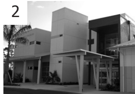
PETER & JULIE CUMMINGS LIBRARY

2351 SE MONTEREY RD STUART, FL 34996 PHONE: 772.288.5702 HOURS: MON/THU 10AM-8PM OTHER DAYS 10AM-5:30PM CLOSED SUNDAYS