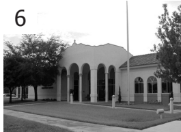
ELISABETH LAHTI LIBRARY

5851 SE COMMUNITY DR STUART, FL 34997 PHONE: 772.463.3245 HOURS: WED 12-8PM OTHER DAYS 10AM-5:30PM CLOSED SUNDAYS