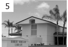
ROBERT MORGADE LIBRARY CHASTAIN CAMPUS IRSC

1150 NW JACK WILLIAMS WAY JENSEN BEACH, FL 34957 PHONE: 772.463.2870 HOURS: THU 12-8PM OTHER DAYS 10AM-5:30PM CLOSED SUN/MON