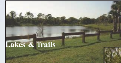
Lakes & Trails