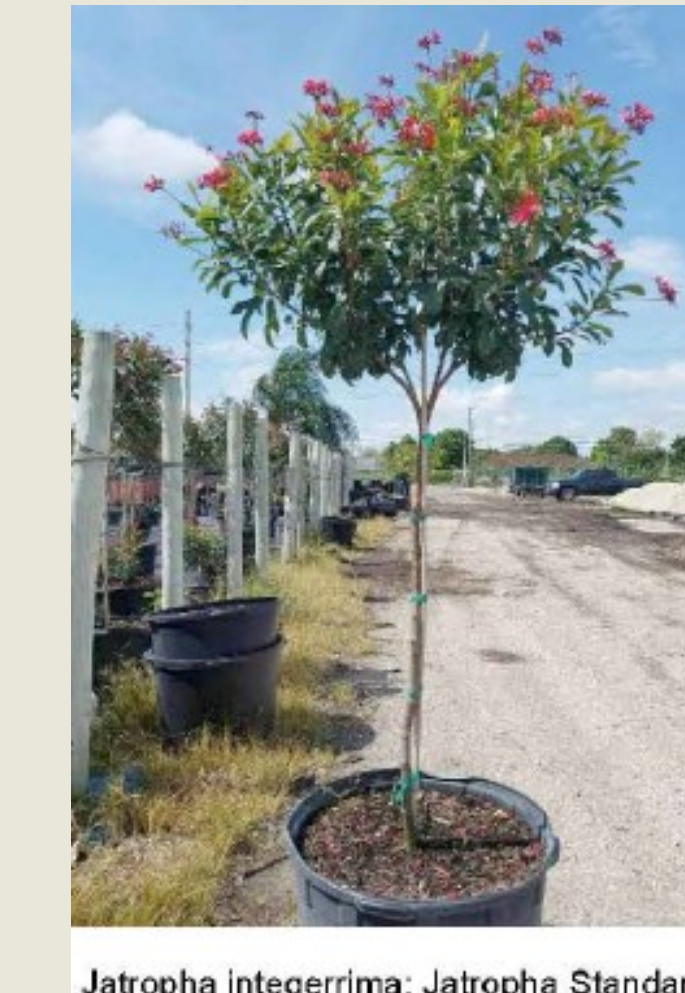
Jatropha integrifolia : Jatropha Standard