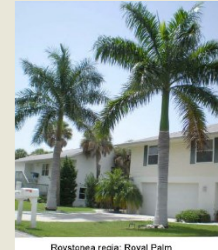
Roystonea regia : Royal Palm