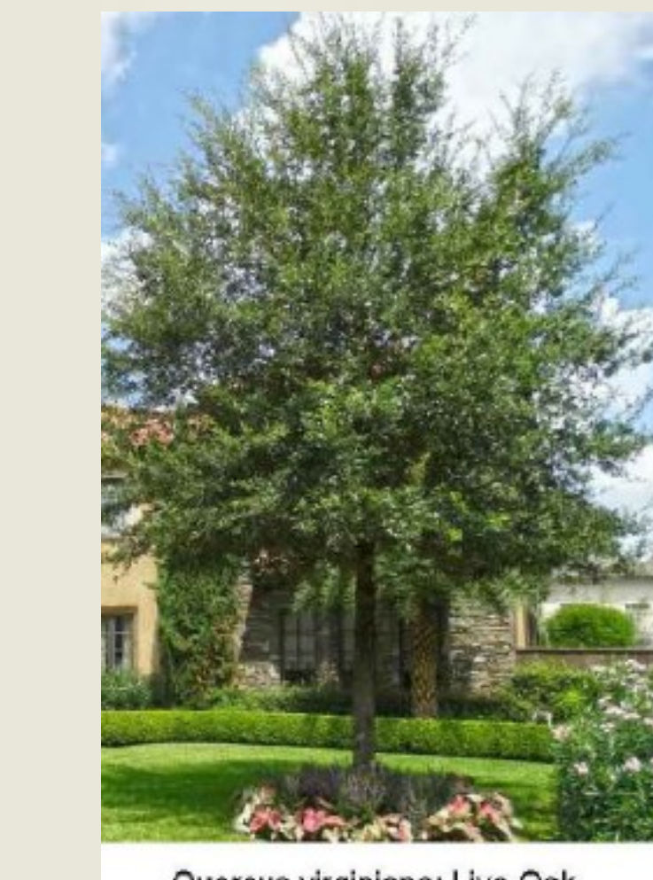
Quercus agrifolia : Live Oak