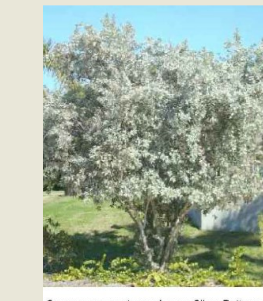
Conocarpus erectus 'Silver': Silver Buttonwood