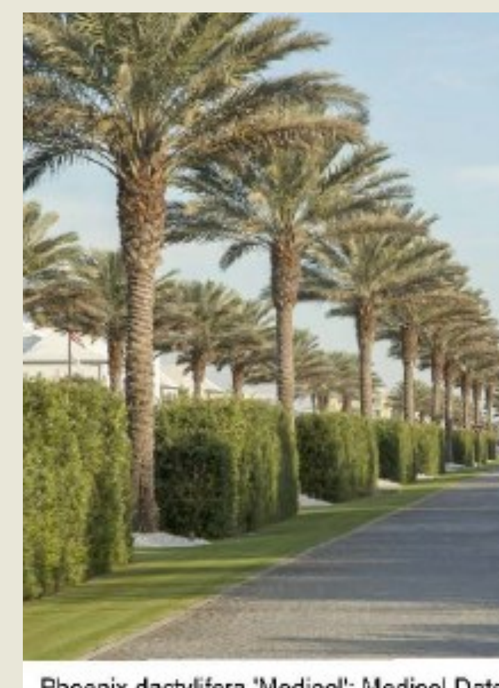
Phoenix dactylopera 'Medjool': Medjool Date Palm