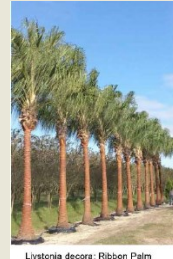
Livistonia decore : Ribbon Palm