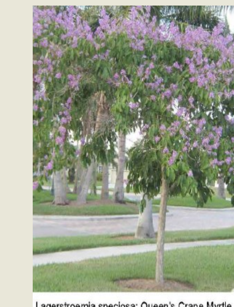
Lagerstremia speciosa : Queen's Cape Myrtle