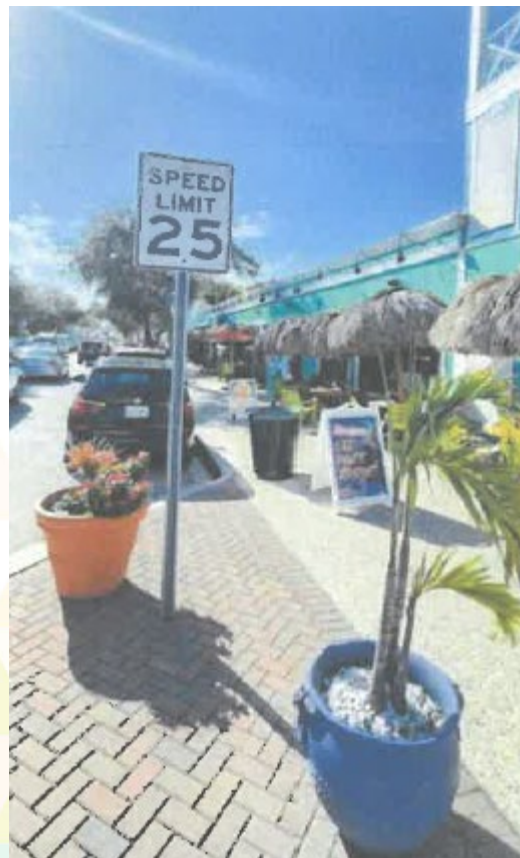
OLD PALM CITY