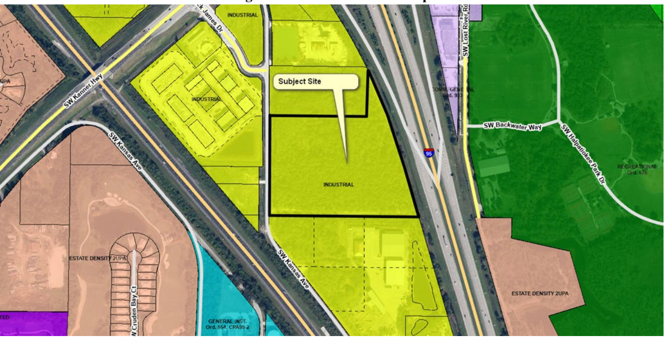
Figure 4: Future Land Use Map

F. Determination of compliance with Comprehensive Growth Management Plan requirements -Growth Management Department