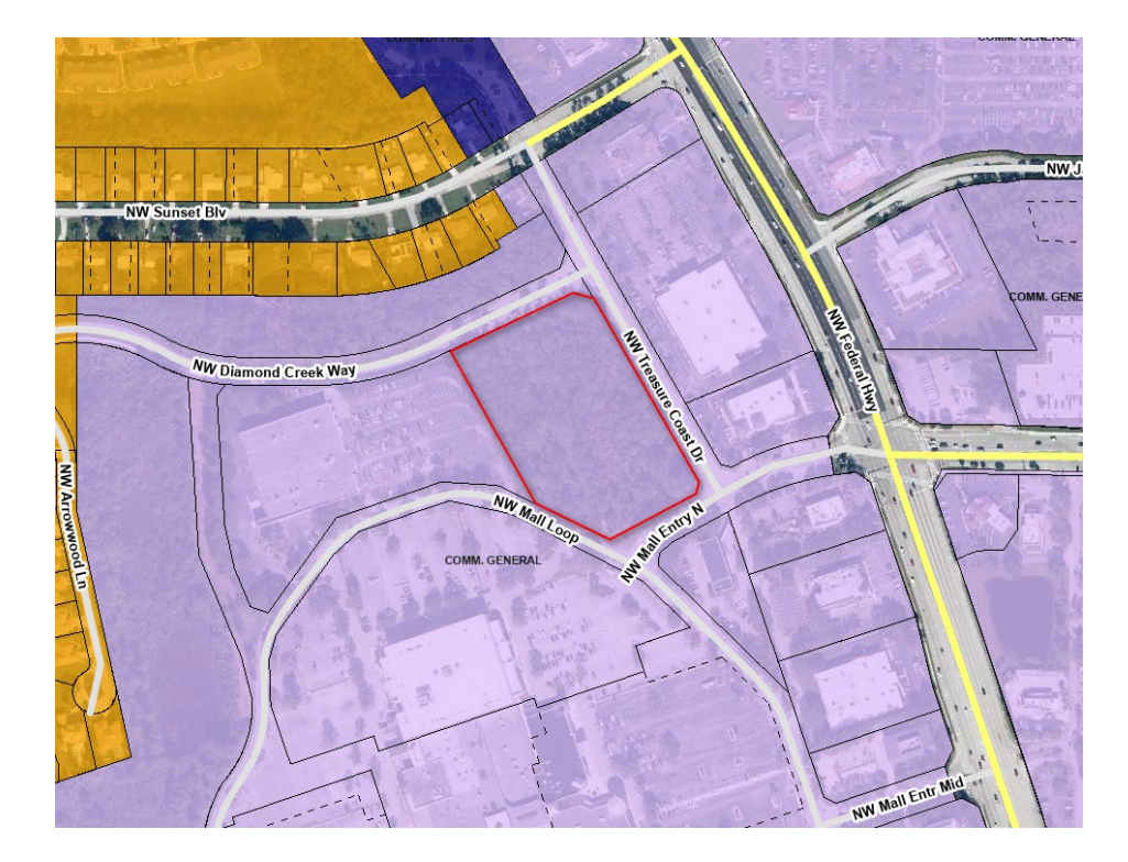
Figure III: Future Land Use Map

Zoning districts of surrounding properties: PUD (C) (Treasure Coast Square PUD)