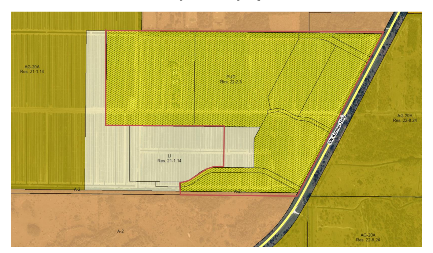
Figure 4: Zoning Map