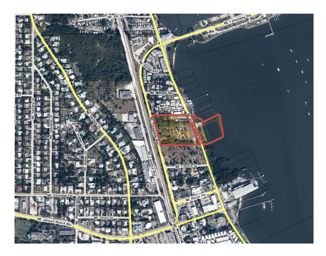
Figure 1: Location Maps