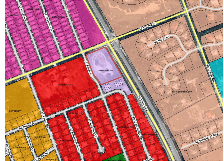
Figure 4: Current Future Land Use Map

Future land use designation of abutting properties: