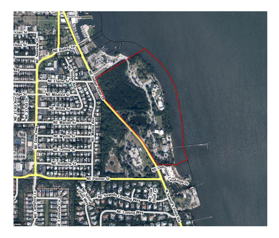
Figure I: Location Map