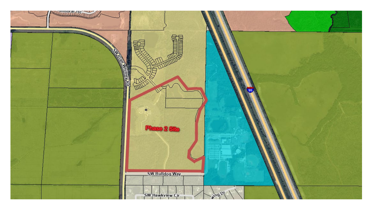
Figure 4: Zoning